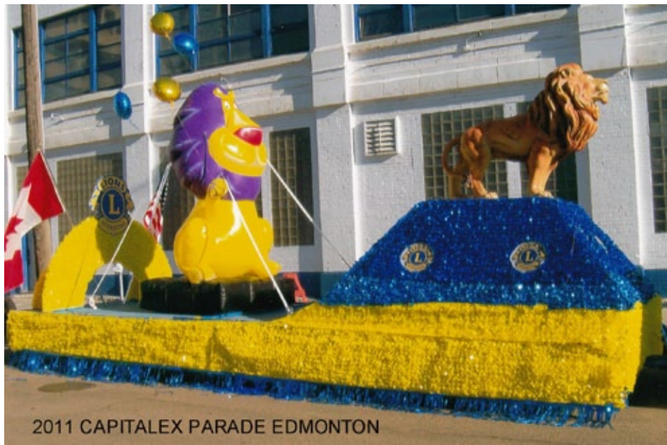
2011 CAPITALEX PARADE EDMONTON