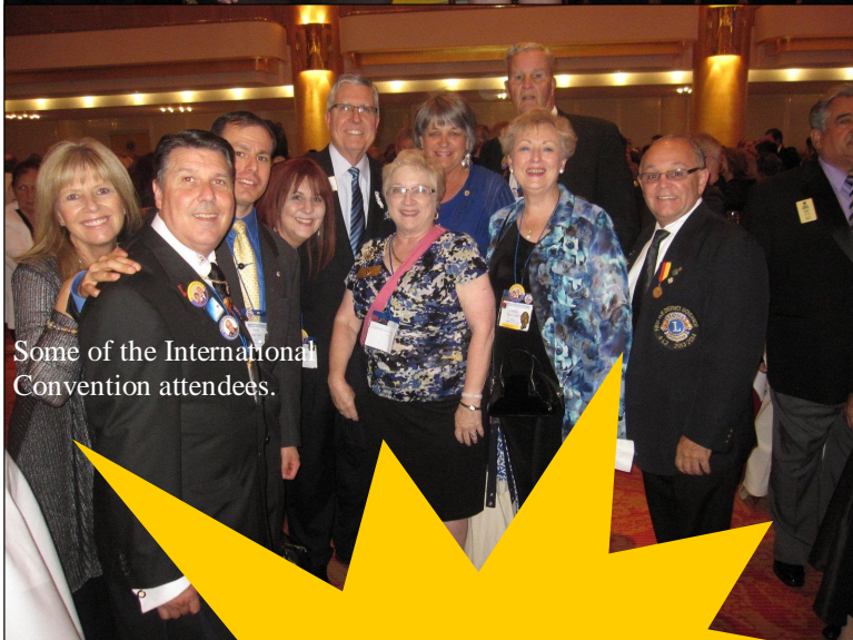
Some of the International Convention attendees.