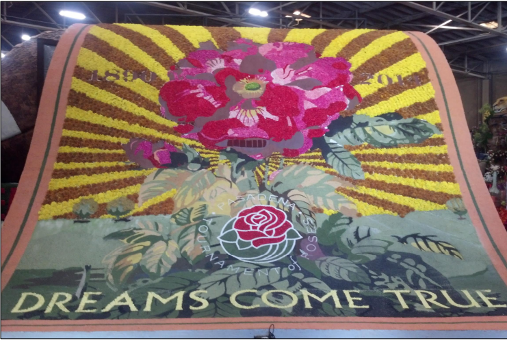
Above: Theme of Rose Parade