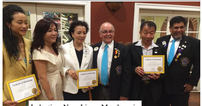
Inducting New Lions Members in District 4L2. Are you a sponsor?