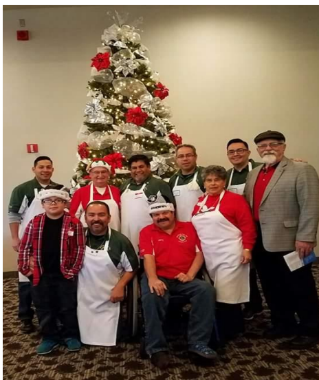
Montebello Lions pause while serving meals at the Quiet Cannon on December 24 th .