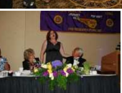
The eye Catcher