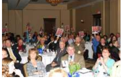
Fall 2013 30