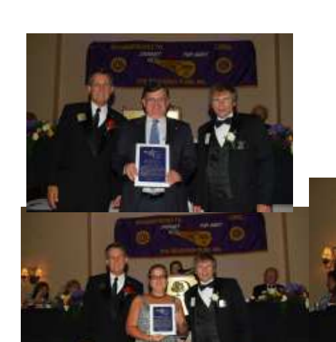
CLUB AWARDS 33-S