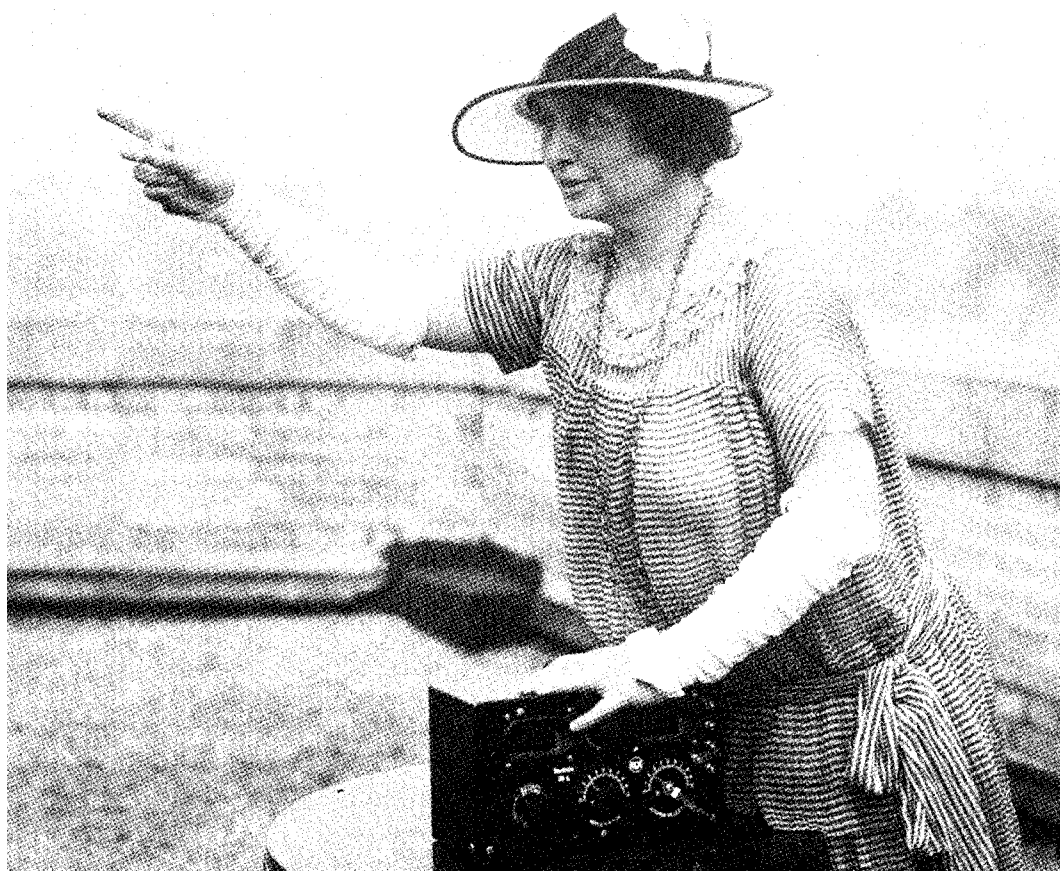
Helen Keller advocated the latest technology for the blind, even when costly. Photographed in 1924 at a meeting of the Uptown Lions Club in New York City, Keller launches a campaign to give radios to poor blind children. The radios cost $75, the equivalent of $950 today.

It is why Lions, twice in the past two decades, have set out to raise tens of millions of dollars worldwide to eradicate river blindness and other preventable vision problems in Africa and other areas. So