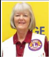
Governor Sue Thompson

DG Sue Thompson, sueok@swbell.net 580-471-0182 or 580-482-8602