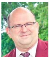
Governor Terry Woodruff