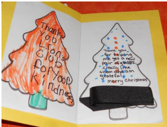
This is why we do what we do! Thank you card from the girl we helped with glasses

Maybe because this is a short month, I have not received any activities reports. Remember if you don’t see your club activities here, it is because they have not been sent to me or posted on the LCI website. Happy Spring!