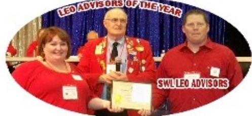
SWL LEO ADVISORS