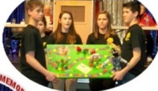
WYLS KINGDOM VALLEY LEOS MEMORY GAME