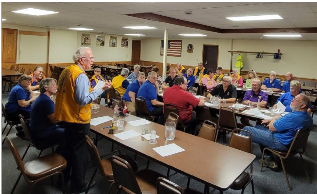
Zones 5 and 6 meeting at Springfield Sept 29