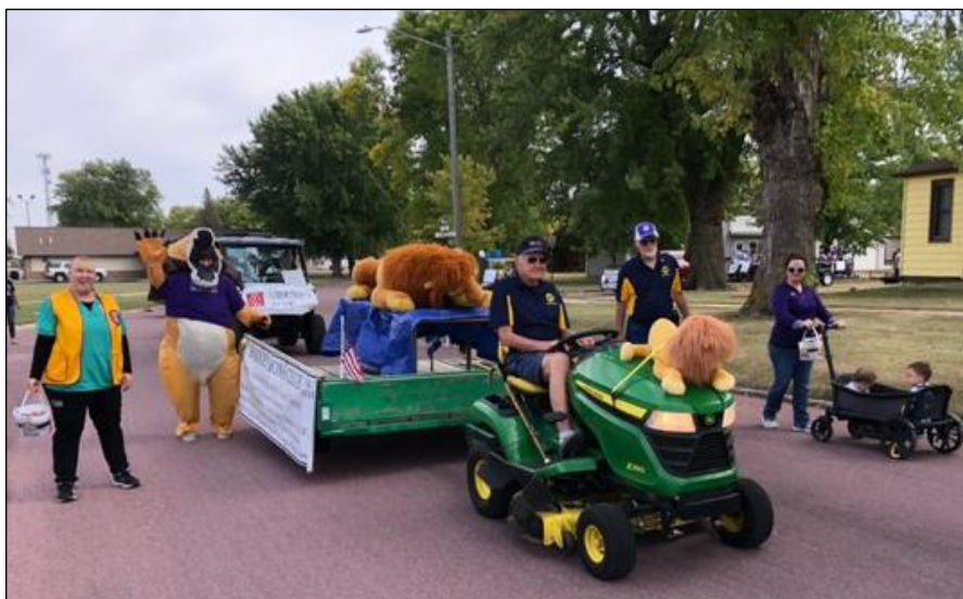
Hadley Lions in Murray County Central homecoming parade