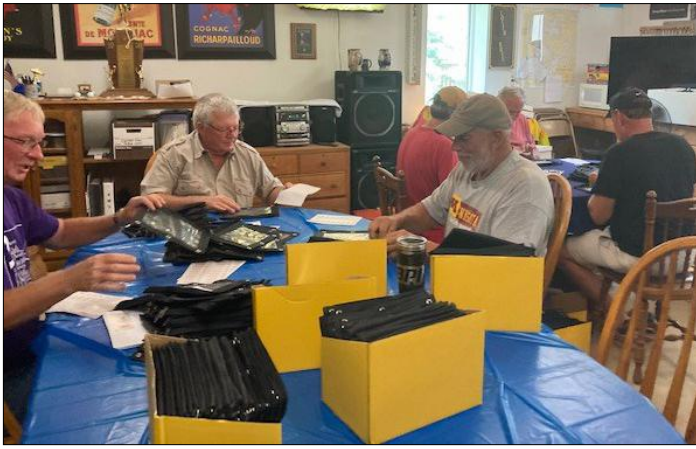
Members of the Sherburn Lions Club assemble Diabetes Emergency Kits