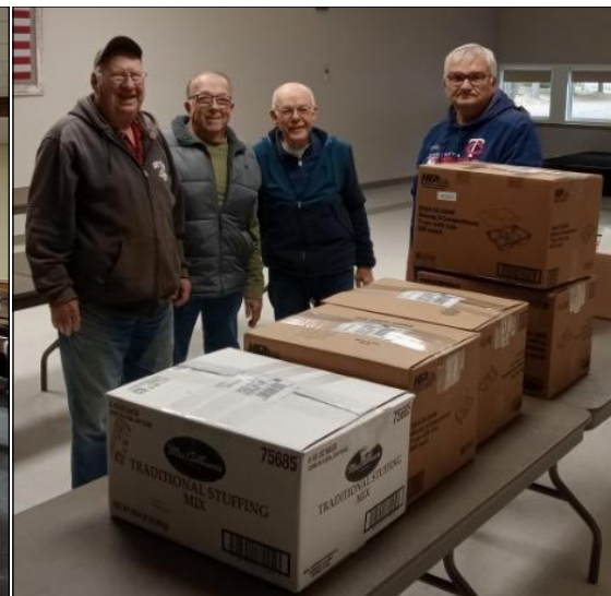
Lucan Lions shipped 78 pair of shoes to Souls for Shoes on Oct 12th