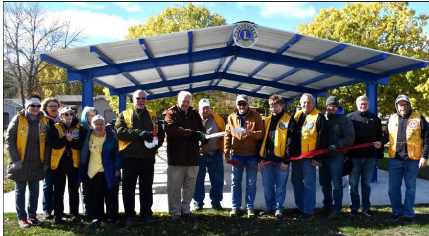
New Ulm Lions Donate Park Shelter

The Lions Club of New Ulm donated a 24 by 38 foot park shelter to the City of New Ulm. The Lions shelter is located in North Park. The cost of the shelter was $41,373. $40,000 of that cost was funded with a $25,000 anonymous matching donation and donations from individual Lions Club members and friends.