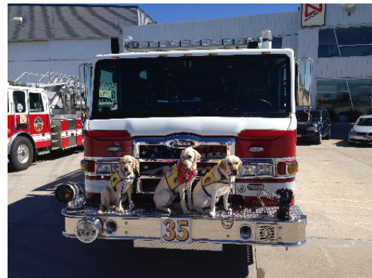
Canine Companions guide South Metro Fire Department.