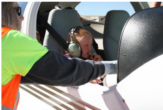
Young co-pilot getting checked out.