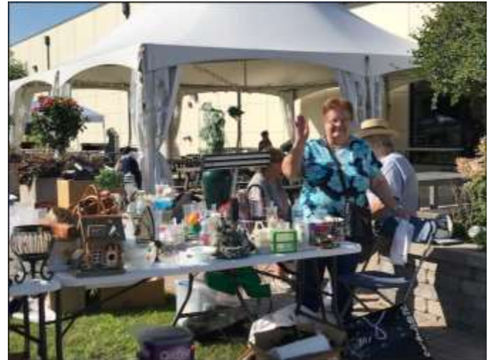
Chicago Northwest Lions Clubs Annual Screening at Eli's Cheesecake Factory. We screened 20 for hearing and found 5 that needed further screening We screened 12 for eyes.

is a veterinarian, owner of Pet Vet in Huntley and working more than full time, so most of her service to the Lions is during her rare "personal" time.