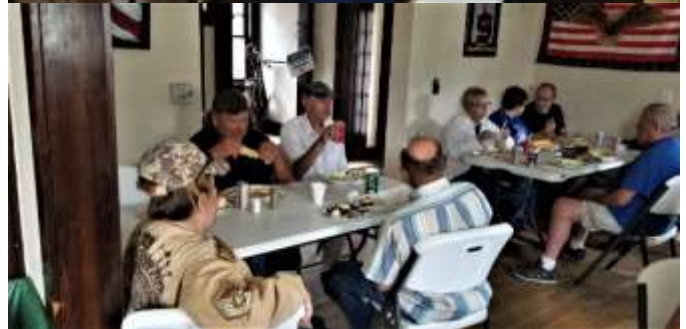
The Leaf River Lions Club fixed a lunch for the Homeless Veterans at the Drop in Center in Rockford on July 27.

Grilled hamburger and brats were served along with fresh sweet corn. Fruit pies are also made and served with ice cream. This was all a big hit with the 21 veterans that were served as they seldom get fresh sweet corn or fresh fruit pies.