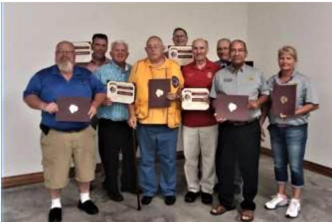
Lions from 1M receiving awards from Lions of Illinois Foundation