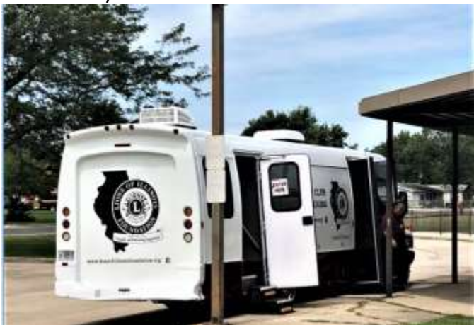
The Altamont Lions Club offered free hearing testing at Altamont Grade School on August 7th and 8th.