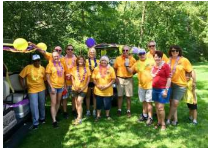
Frankfort Lions ready to take part in the parade.

Our Finest Bartlett Police lending a helping hand as always.