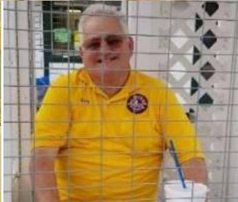
Lions doing good around the world.