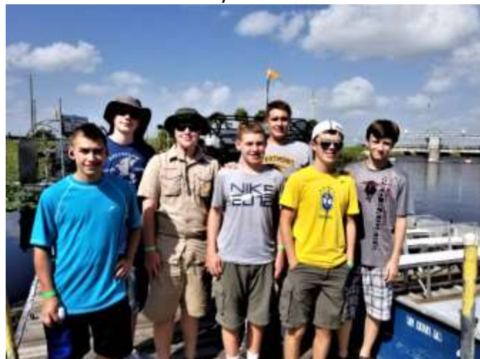
This past summer, Westmont Lions Club helped send their local community Westmont Boy Scout Troop 6 to the Florida Keys on an Eco-STEM adventure on a sailboat for a week through Boy Scouts high adventure Camp Sea Base. Seven Boy Scouts and five leaders were able to attend, and on this trip, Scouts learned about the many habitats and ecosystems within the Florida Keys. They participated in nightly classes regarding the environment in which they were interacting. One of the main areas the Scouts learned about was the importance of the Mangroves and how Mangrove forests are home to a large variety of fish, crab & shrimp, and how their dense root system allows the trapping of flowing sediments which helps stabilizes