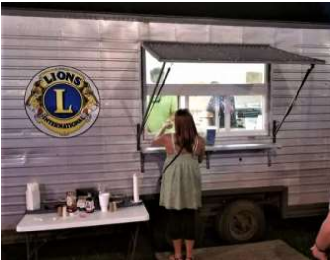
Blue Mound Lions serve with style. Their steak sandwiches are a big hit at the annual Blue Mound Fall Festival.