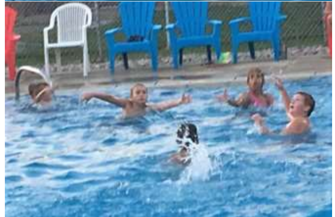
Arthur Lions Club held a Pool Party for children through 8 th grade and their families. The pool party included snow cones, hot dogs & chips, a DJ, and of course, swimming. Everyone had a great time. *****