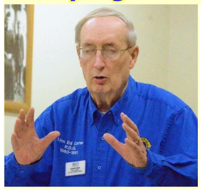
We Are on The Road for Campaign 100.

"On the road again". There are not many people who won't hear Willy when they see those words. The truth is it is a bit of slogan for your Lions Clubs International Foundation chairs as they enter this fourth and certainly hopefully final year of the Campaign 100: LCIF Empowering Service.