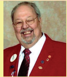
Governor Wes Salsbury