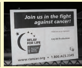
The cancer walk was held at the Elmwood Park High School starting Friday evening and continuing on through the NITE into Saturday Morning