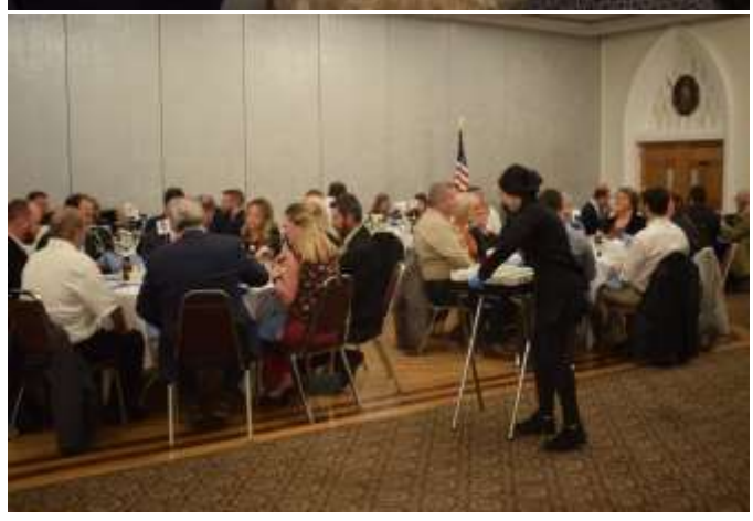
Palos Lions Club awarded Community