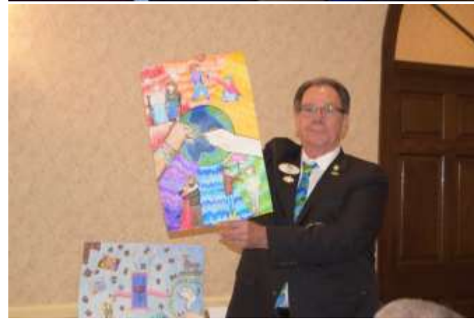
Best Peace Poster of District 1A voted