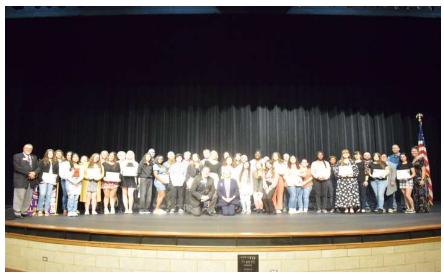
Oak Lawn Richards High School Leos Induction and Officers Installation.