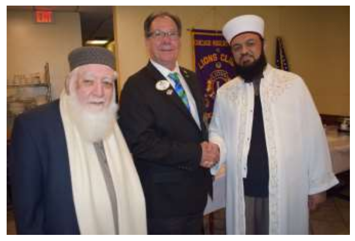
Chicago Rogers Park celebrated their Charter Night and installed new officers.