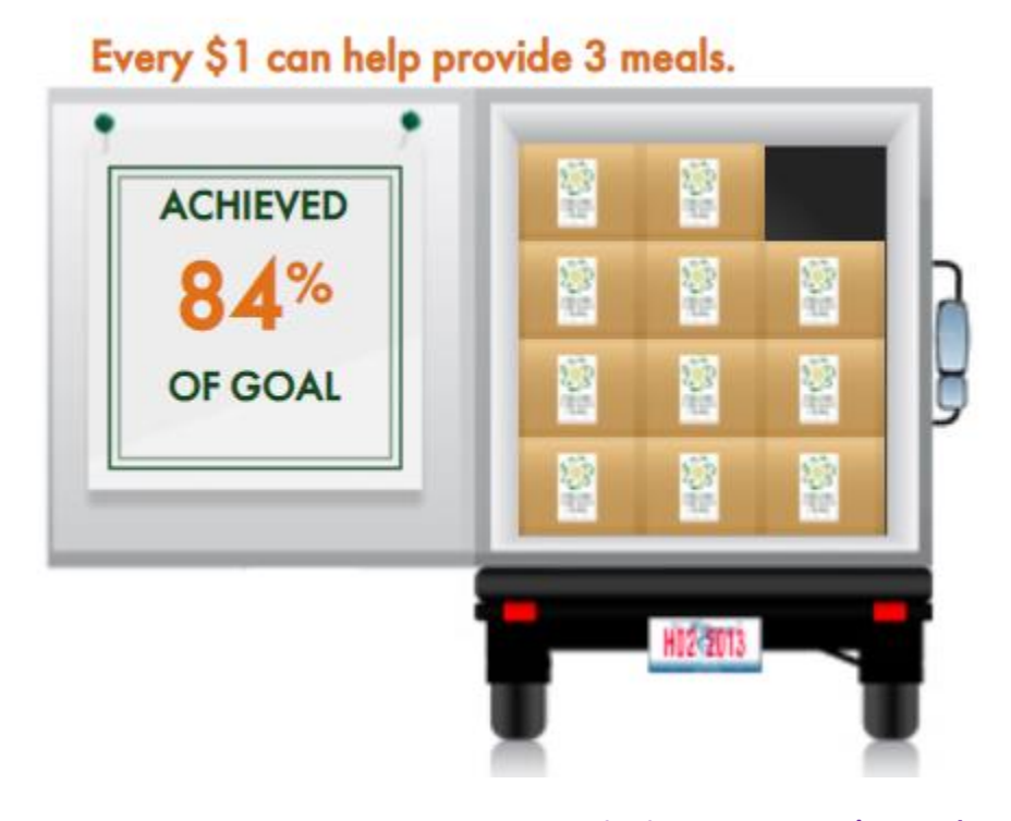
13 District 1A Governor's Newsletter