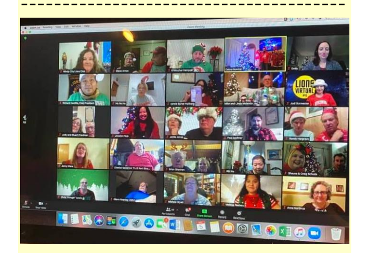
Chicago Windy City Lions had their Annual Drink with Santa Virtual even in the month of December 2020.