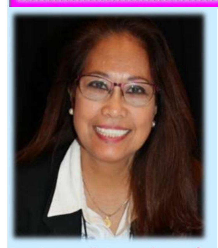
Greetings to all Lions and Leos of District 1-A

I hope that you and your families enjoyed the Holidays Season, and all are doing well. I wish you all a Healthy and Prosperous New Year!