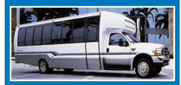
USA-Canada Lions Leadership Forum www.usacanadalionsforum.org

From the Kenai, headed north into Anchorage, you will take the Seward Highway, which turns into a 4-lane road just as you enter the outskirts of Anchorage. To reach downtown, stay on the Seward Highway and turn left on 5th Avenue.