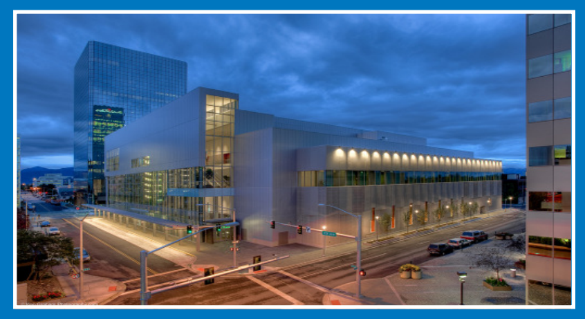
The Dena'ina Civic & Convention Center in Anchorage, the site of most activities of the USA-Canada Lions Leadership Forum.