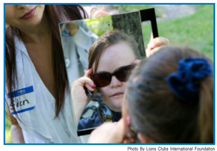
A volunteer fits a Special Olympics' athlete with a pair of eyeglasses