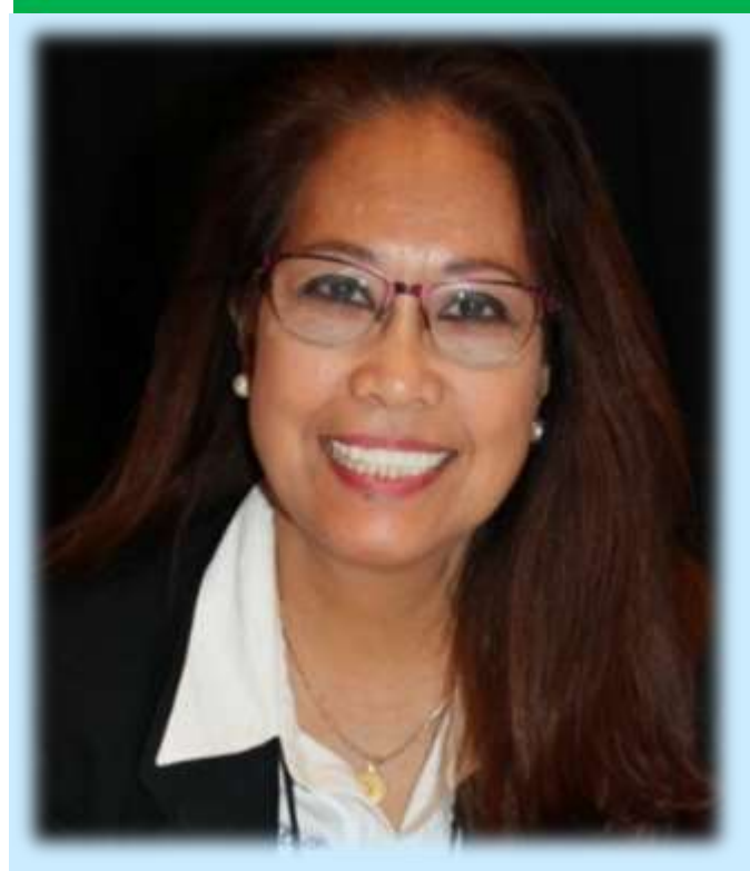
Greetings to all Lions and Leos of District 1-A

The holidays are around the corner. Thanksgiving Day is the perfect time to remind us of many reasons to be grateful for, in any possible way how we will celebrate in this unusual environment. As everyone