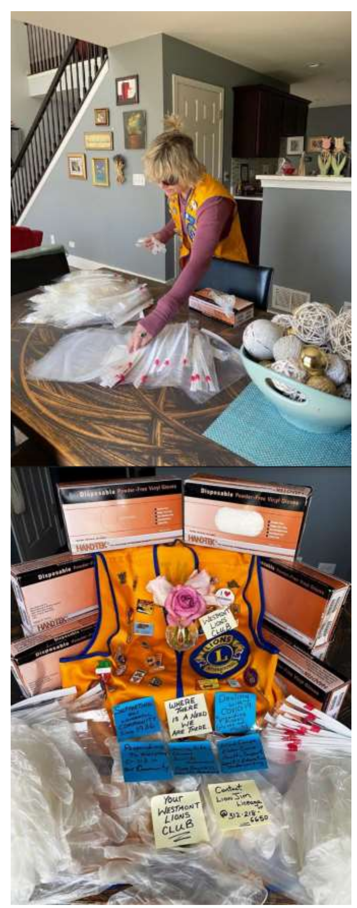
Disposable latex gloves are being packaged by Westmont Lion Sandy for Lion Jim