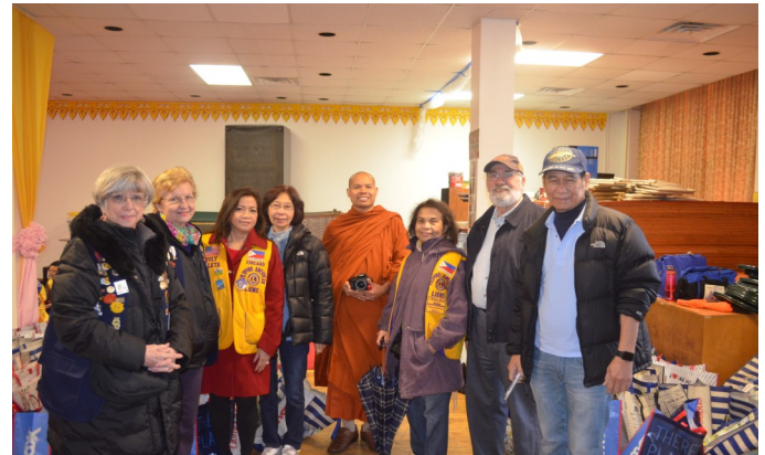
THAI MIDWEST COMMUNITY SERVICE PROJECT - FEEDING THOSE IN NEED