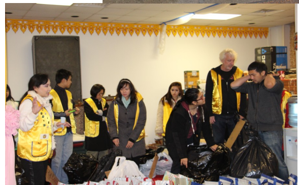
THAI MIDWEST COMMUNITY SERVICE PROJECT - FEEDING THOSE IN NEED