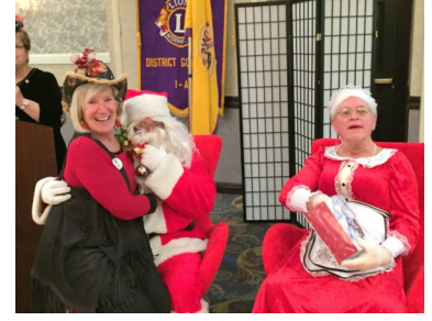
DISTRICT 1-A LIONS CELEBRATING CHRISTMAS