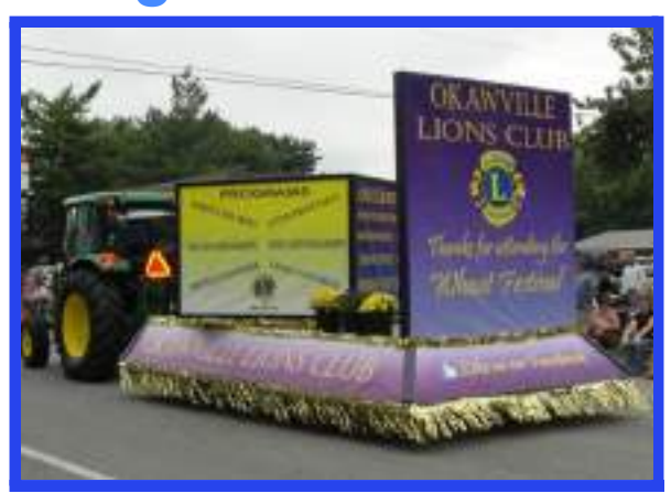
Okawville Lions Club For winning the April 2022 Early Bird Drawing