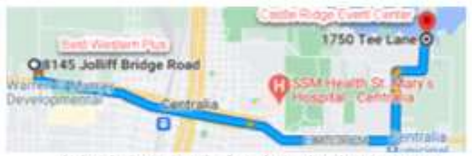
The hotel is located 5 miles from the Castle Ridge Event Center.

Hospitality rooms and a light buffet meal will be provided Friday evening at the hotel for those registered.