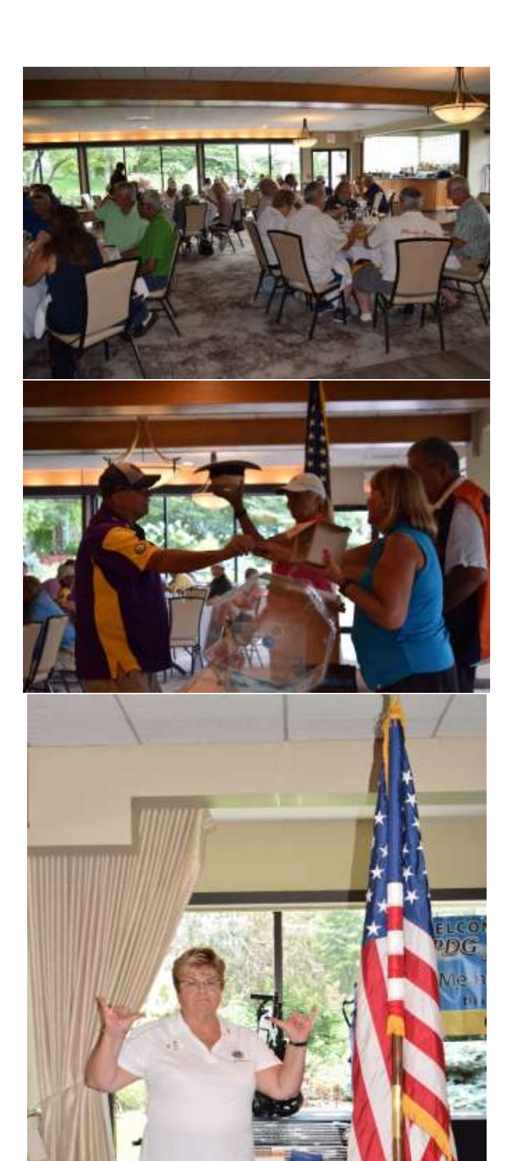
9 District 1A Monthly e-Newsletter