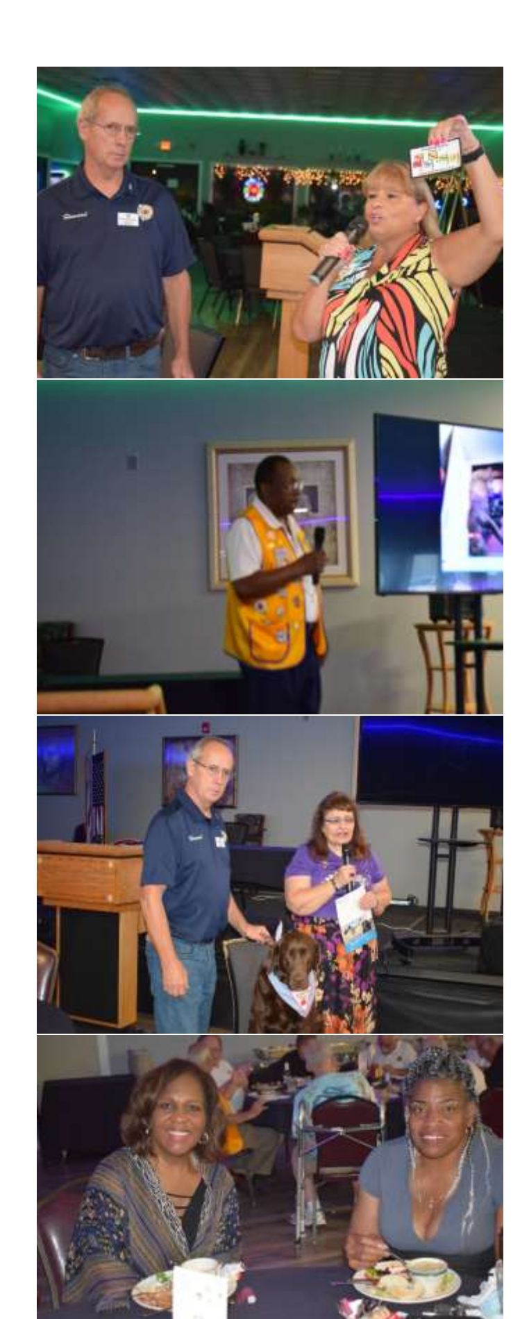
11 District 1A Monthly e-Newsletter