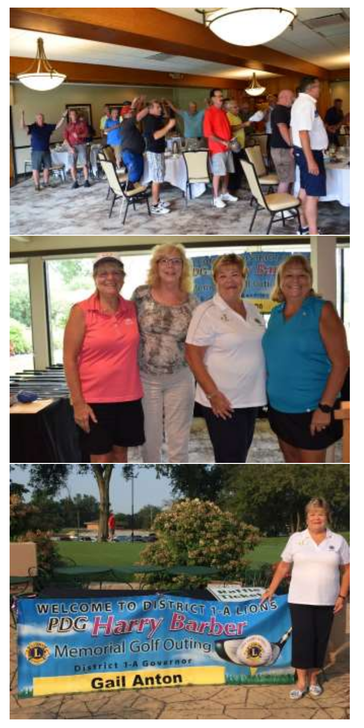
FIRST REGION 2 MEETING