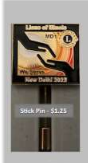
Not Actual Size Shown