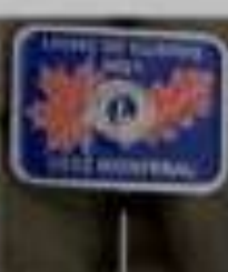
Stick Pin - $1.25