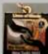
Charm - $1.25