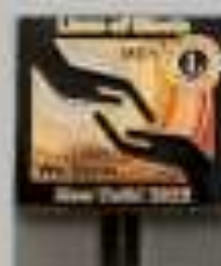
Stick Pin - $1.25