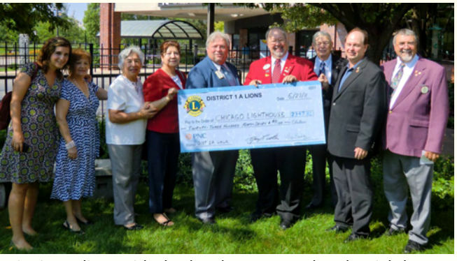
District 1a lions with check to be presented to the Lighthouse