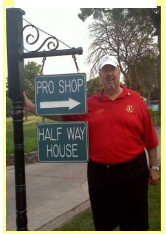
Thanks, Thanks, Thanks !!! A big thank you to everyone who volunteered and supported the District 1-A Golf Outing

Until later, on my bike, Gov. Wes Salsbury