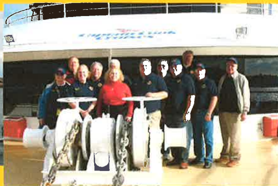
THE 2010-11 Council of Governors for Illinois