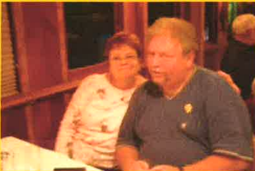
Dinner at South Steyene Seafood- Darling Harbor, Sydney, Australia