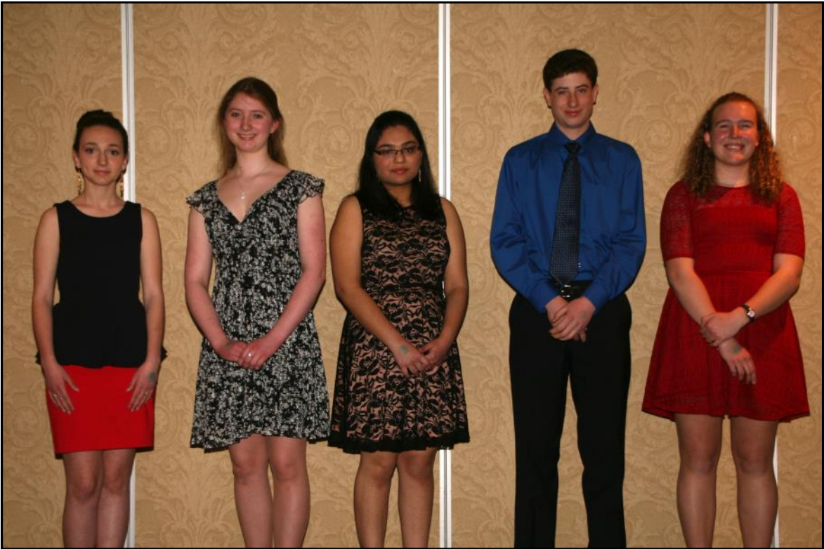
Effective Speaking English Intermediate Contestants