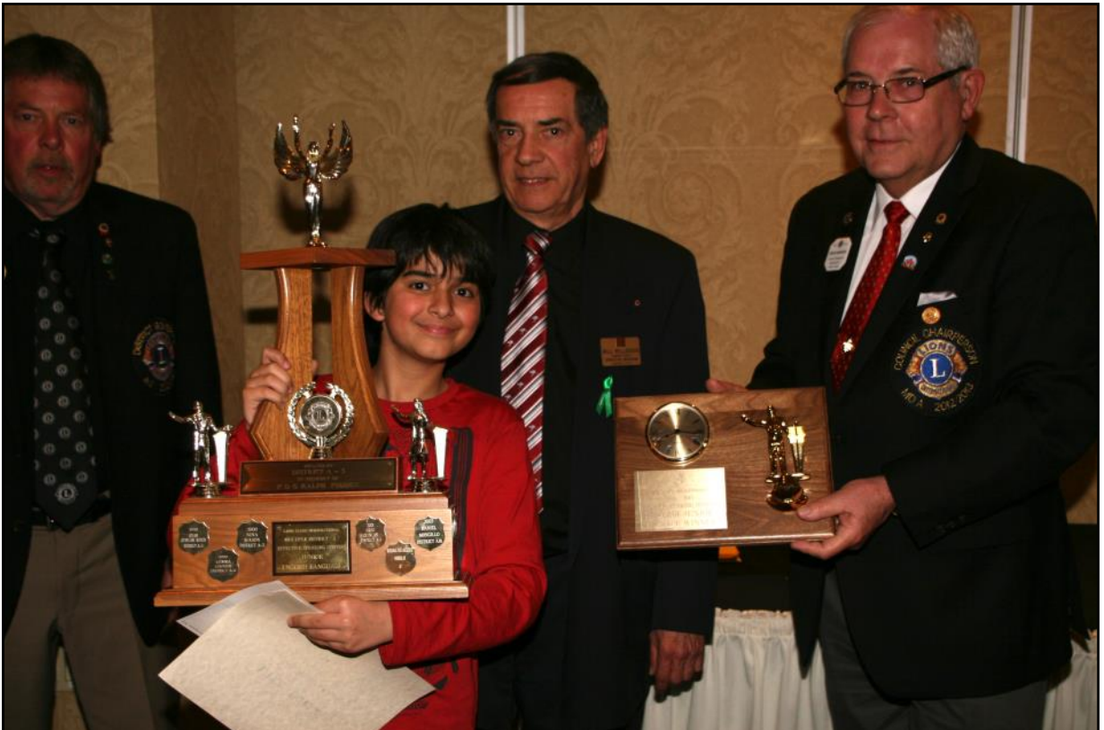
Effective Speaking Junior English First Place Winner