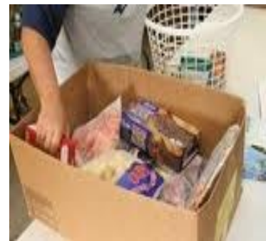
Holiday Food Boxes for Local VIPS