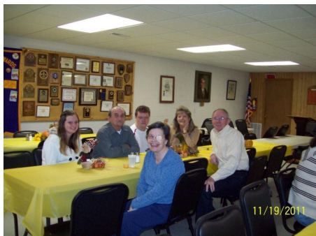
2011 Holiday Meal for Local VIPS