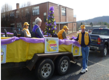
2011 Sparta Christmas Parade