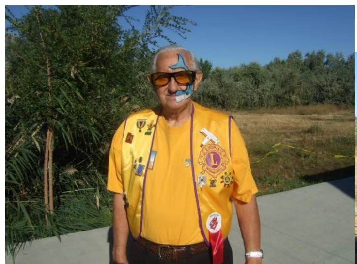
Al with new Face