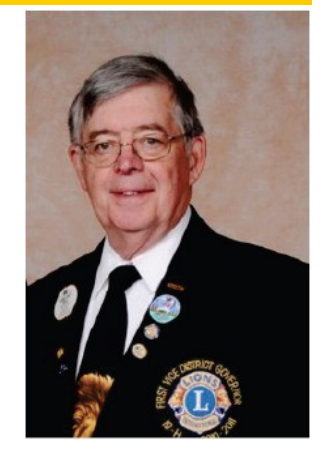
"I challenge each of you to do what and when you can to make your club the best it can be"

P.S. You can find the guide at http://www.lionsclubs.org/EN/common/pdfs/mk9.pdf