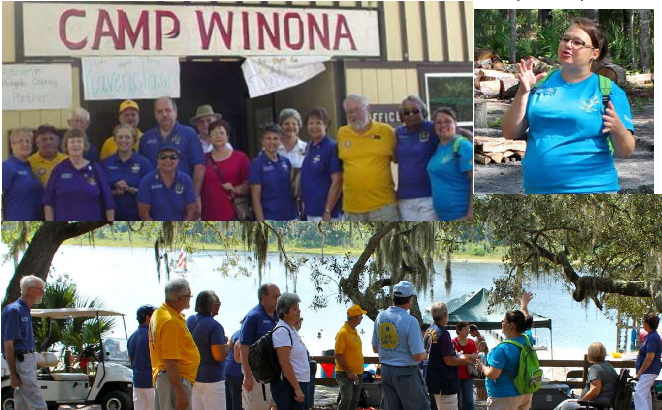
Pictured Below: 1 st District Meeting hosted by the Clermont/Minneola Lions Club