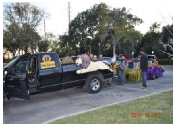
Kissimmee Lions getting ready for Christmas parade