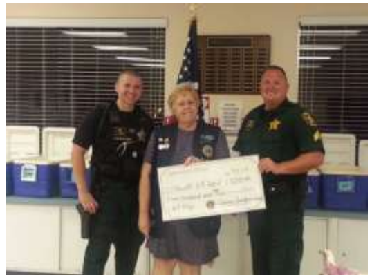
Cypress Gardens helping out the community