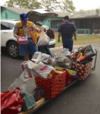
Viera Lions loading up Santa's Sleigh