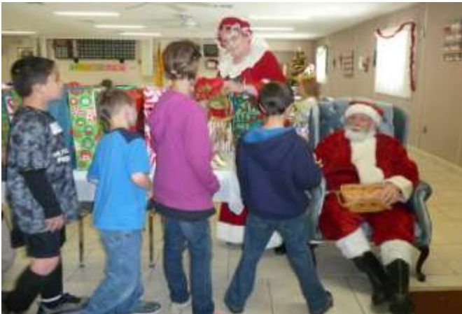
Mr. & Mrs Santa Claus with the children of Homosassa.