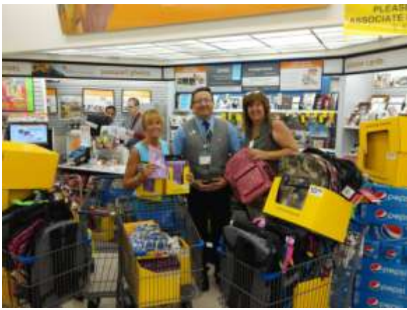
Rockledge Lions hard at work SHOPPING!