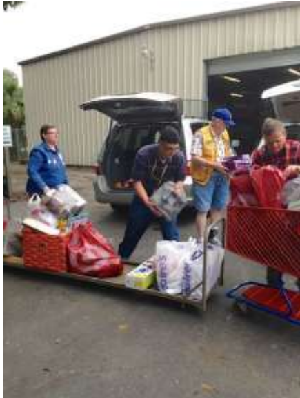
It takes many hands to help Santa