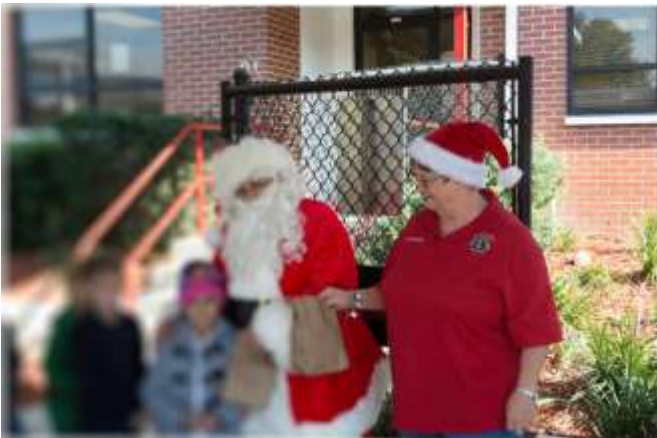
Santa and one of his elves giving out the goodies to the Lake Alfred school children.