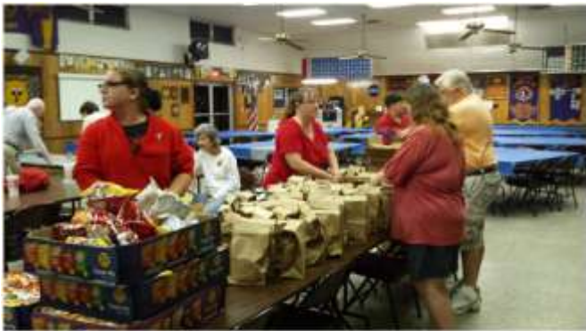
Bagging Christmas goodies for school children in Lake Alfred.