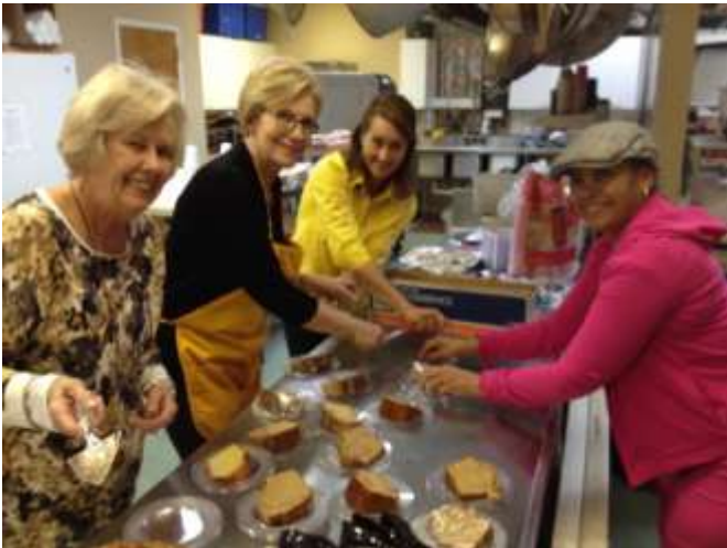
Fun things happening at Hernando Lions Club