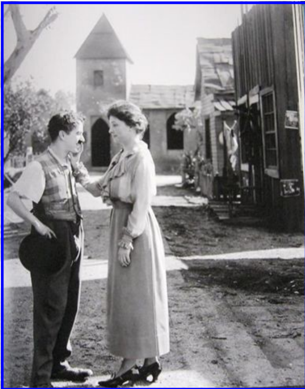
Helen Keller Meeting Charlie Chaplin