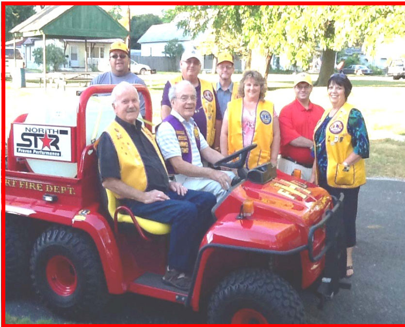
The Hobart Lions Club recently purchased a piece of equipment for the Hobart Fire Department. The 55 gal. tank with 150 ft hose is designed to put out brush fires. It is accessible to remote places where larger trucks can not reach.