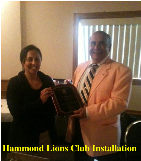
Hammond Lions Club Installation