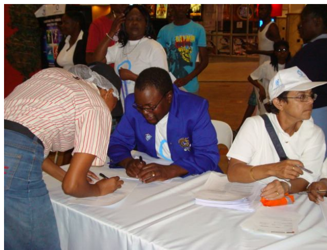
A participant completes her details prior to screening with the help of a lion

I have always thought of Christmas time, when it has come round, as a good time; a kind, forgiving, charitable time; the only time I know of, in the long calendar of the year, when men and women seem by one consent to open their shut-up hearts freely, and to think of people below them as if they really were fellow passengers to the grave, and not another race of creatures bound on other journeys.