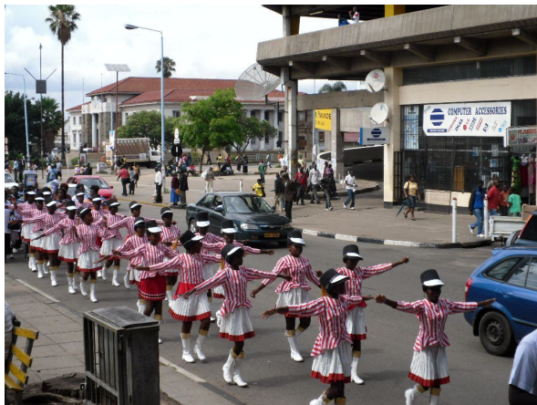
Part of the colourful march