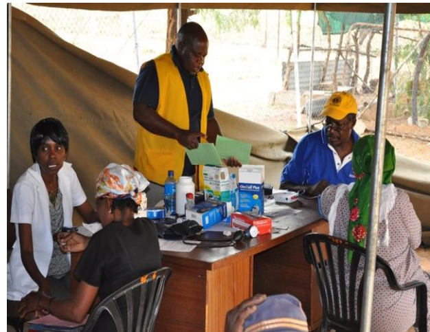
Lions processing the paperwork