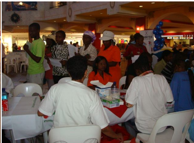
Patiently waiting for their turn