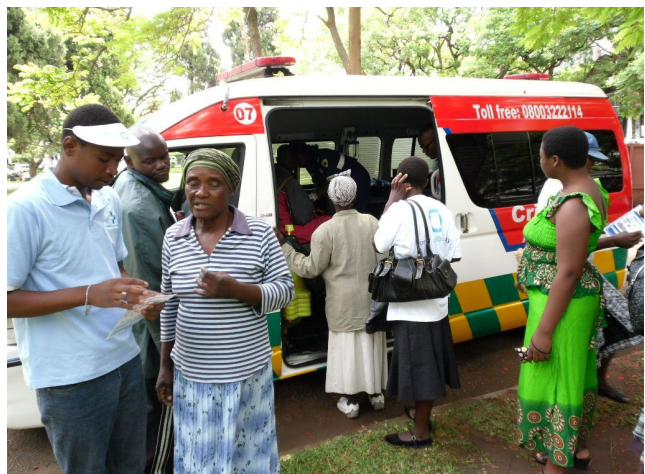
An ambulance was used to screen volunteers for diabetes after the march