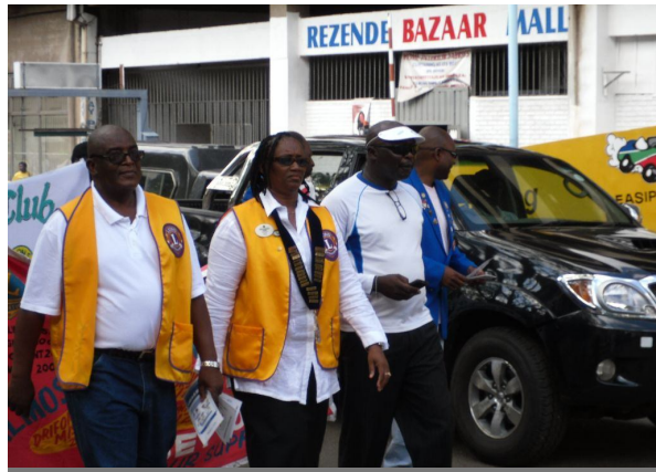
From left: The SVDG, DG, Diabetic Ass Chair and Zone 2C Chair