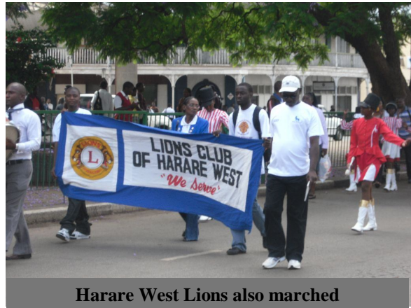
Harare West Lions also marched