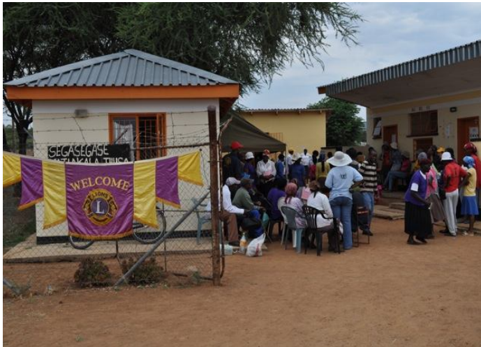
Part of the crowd waiting to be attended