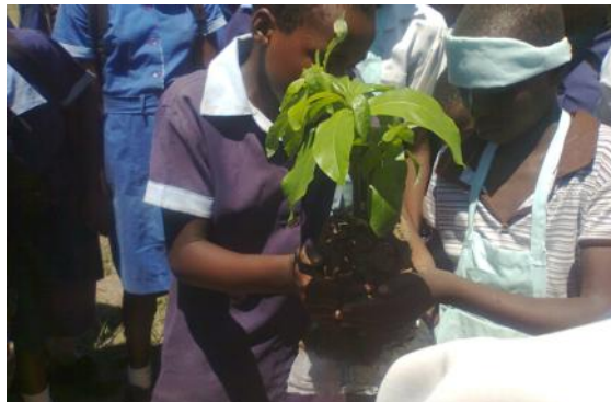
Shabani primary kids happily going green

Lastly on their busy and hectic schedule was Ngomayebani Primary school which was on the 2nd of December , where again another 50 trees were donated and planted. All this was made possible by the partnership of the Lions club and the Forestry commission and the Environmental Management Agency