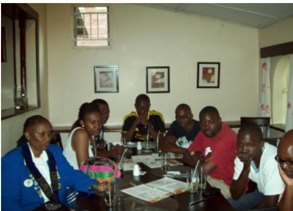
University of Zimbabwe Lions with the DG watching the International Presidents Theme