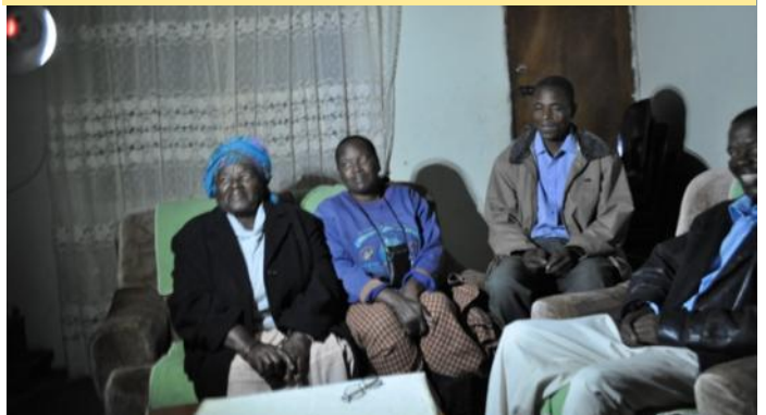
Enjoying the solar light in their home thanks to the Lions