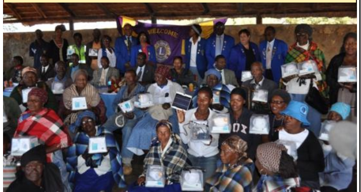
Seated in the centre of the beneficiaries is Dr Ponatshe Kedikilwe, Hon Minister of Energy, Government of Botswana. Standing at the back are members of Lions Club of Lobatse