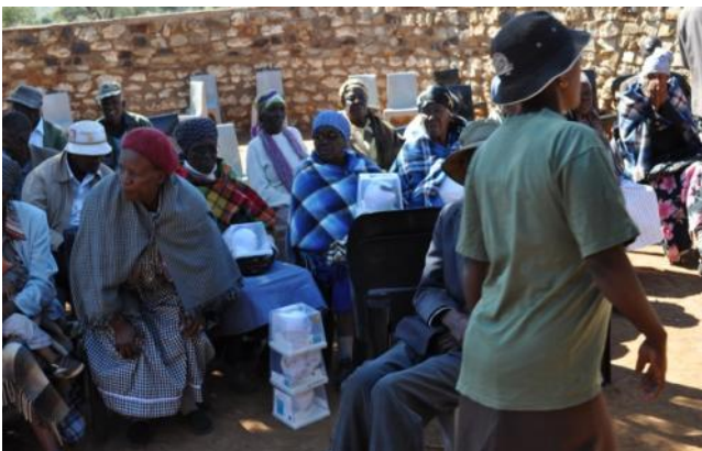
Part of the gathering