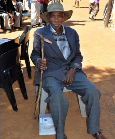
One of the beneficiaries

In partnership with Lions Clubs in Europe who made the donation, Lions Club of Lobatse, Botswana has been able to provide Lemnis Solar Lamps from The Netherlands to 39 homes in village Bethele.