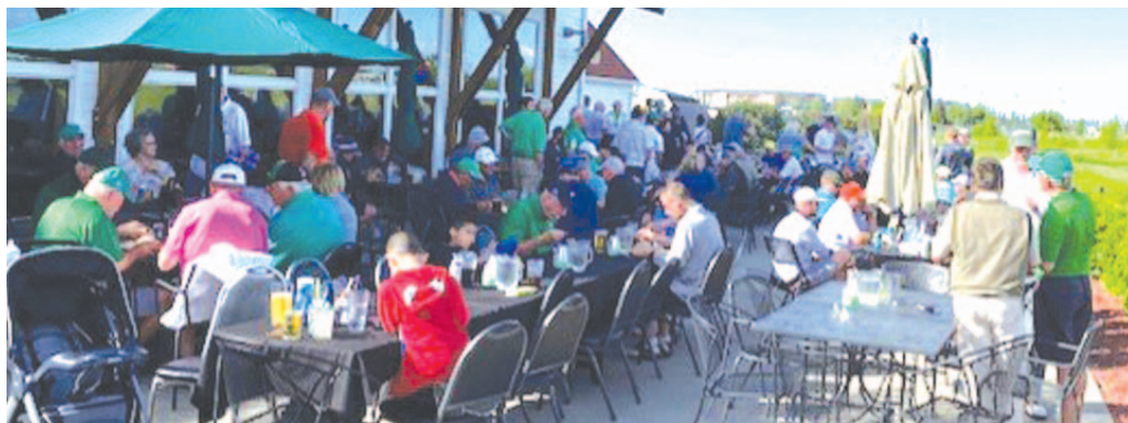
Steak dinner following the event.