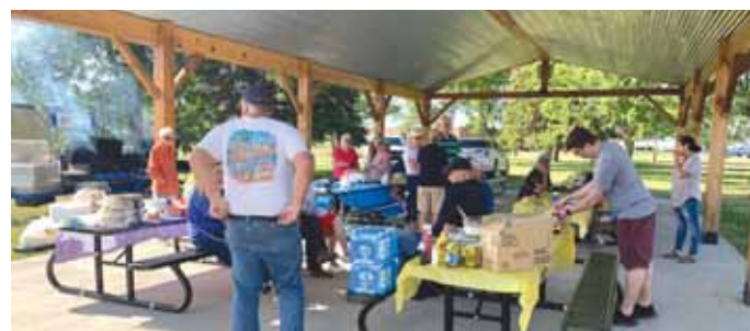
Korner Lions enjoy some fellowship at their annual awards picnic in June.