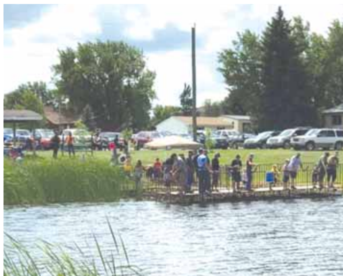
Glenburn Fishing Derby - dock