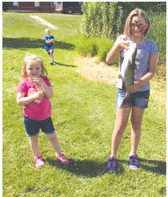
Kids with fish. More pictures on page 4