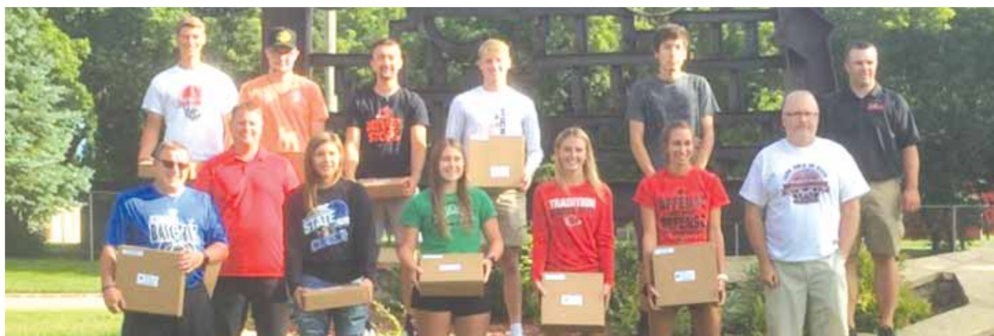
Pictured above are the All-Star athletes & coaches after they received their "package" of materials at Devils Lake.