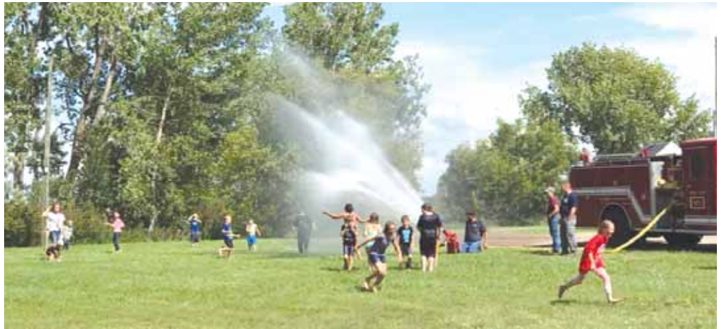
Glenburn Fishing Derby - fire truck.

Glenburn Lions did an awesome job of hosting and organizing "Fun Day Sunday" - a Kids Fishing Derby at the Glenburn pond on July 19, 2020. 45 children (and their parents) had a great time with fishing, outdoor games, face painting, and getting sprayed by the Fire Truck. They also enjoyed hot dogs & hamburgers, and received donated prizes. The local Park Board assisted with serving the meal. Prizes were donated by Glenburn and Minot businesses - every child who attended received at least 2 gifts. Kudos to the local fire chief for spraying the kids with the fire truck. It was a beautiful day with an