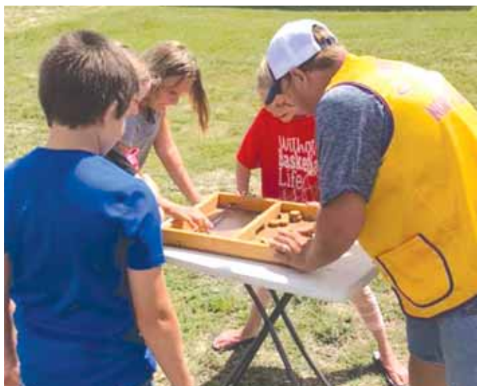
Glenburn Fishing Derby - game