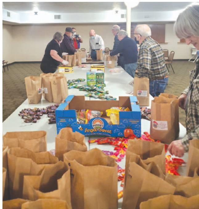
New England Lions filling candy bags, while observing mask and distancing guidelines.

The New England Lions typically bag candy for Santa to give children after the New England Public School Christmas Concert. Several hundred children have the opportunity to sit on Santa’s lap, have a picture taken with Santa, and get their bag of candy and peanuts.