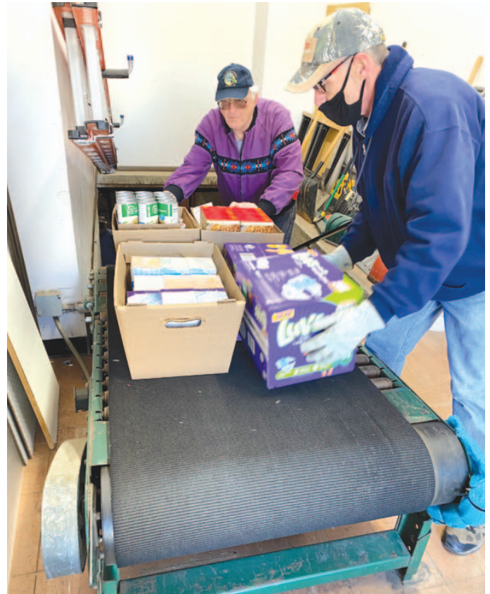
Lions unload food at Aid Inc.