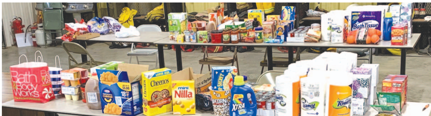
Food items purchased to be donated to various pantries.

The South Heart Lions Club purchased food for local families and food pantries. The South Heart Lions heard about the needs in the community and decided to purchase $100 worth of food items for a couple of families to help out over the holidays. Donations were received from the club members that assisted with the cost of the items. The total raised was $740 for the service projects.