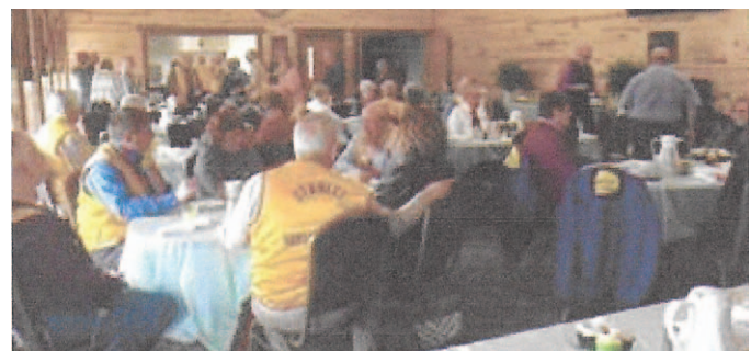
A very nice group of Lions and their spouses attended the ladies night supper on April 26th at the Pines in Stanley.