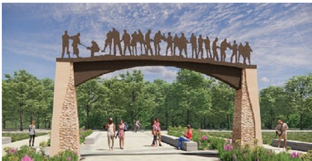
Spirit of the Sandbagger public art is a Centennial Project of the Fargo Lions Club.