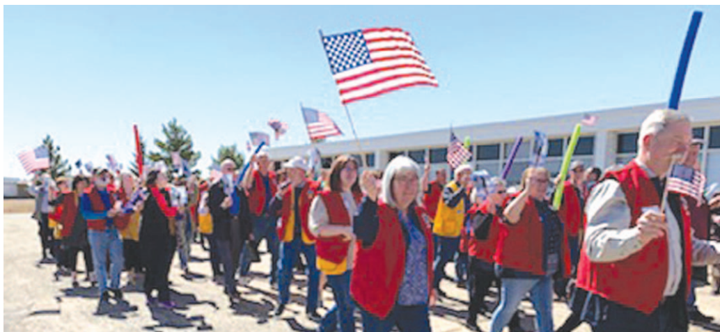
5NW Lions march in a parade @ the Spring Rally. The parade was videoed and will be played during the virtual International Lions Convention in June.