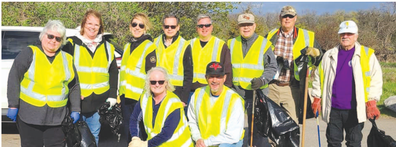
The Fargo Lions Club and their families cleaned ditches along South University Drive and tidied up the Lions Conservancy Park. We Serve in wind and cold -- next time you are in the area, visit the Lions Conservancy Park. It is filled with native grasses, wildlife and birds. It is a lovely little spot on a bow in the Red River.