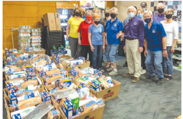
This is just part of the food boxed for the pantry.

Pre-COVID the Bismarck Lions Club served breakfast to this community every Thursday. We look forward to resuming our weekly service. Until we can meet again in person we were thrilled to be able to bring smiles to the families that came to the Ministry on the Margins Food Pantry.