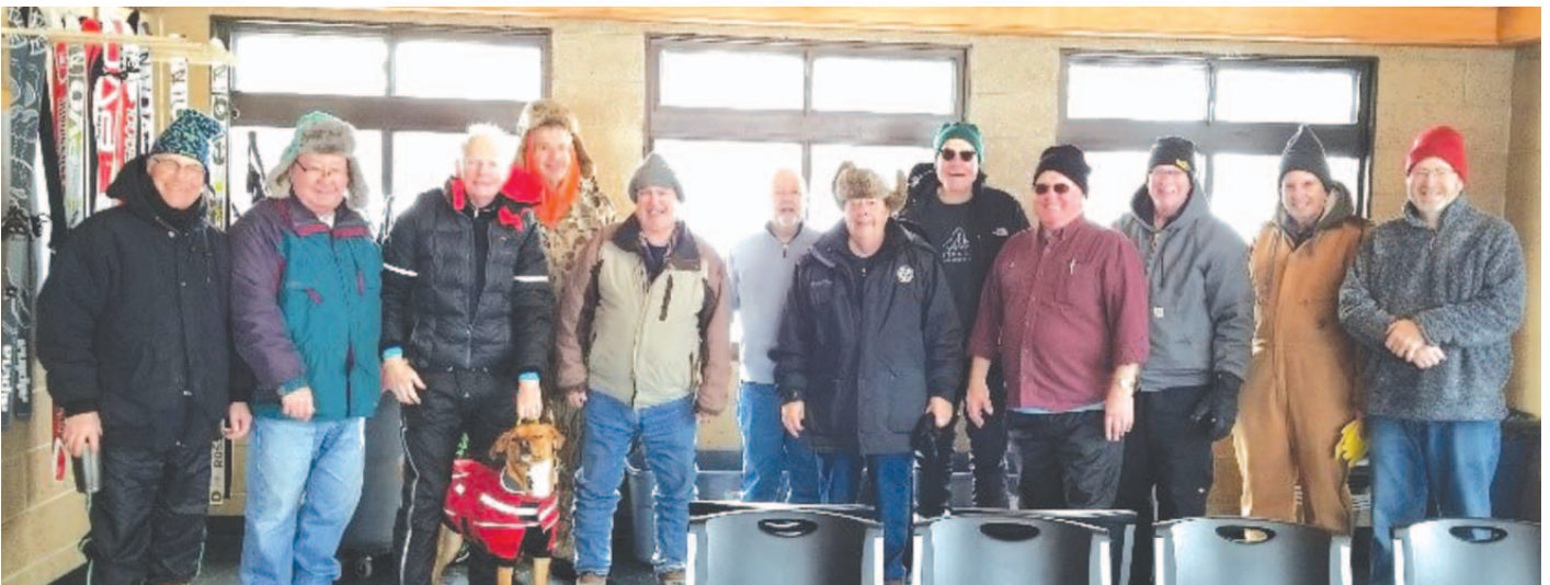
South Forks Lions work crew (with someone's infamous dog) take a break on a very cold day of removing displays from another successful Christmas in the Park event.