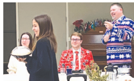
On December 21st, the Magic City Lions held their annual Christmas Holiday Bake Sale Auction. $2,844 was raised to be donated to LCIF disaster relief.