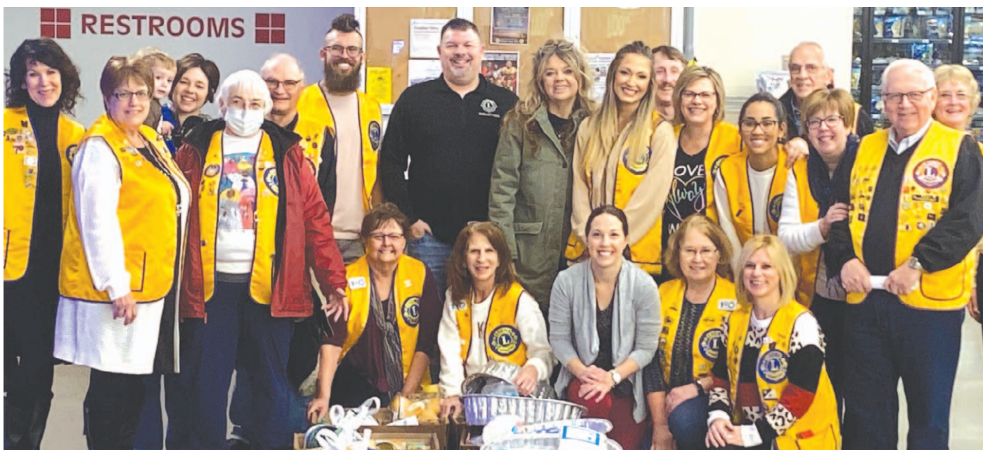
In November, the Magic City Lions packed and delivered 20 Thanksgiving dinner boxes to local families in need.