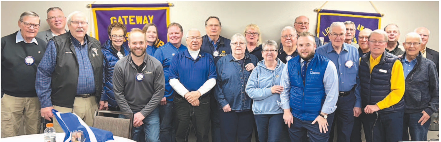
Gateway Lions, wearing blue attire, are pictured after their March 4th meeting. “WEAR BLUE DAY” is a day to spread awareness of colon cancer.