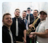
• The Bromantics - Twist the Night Away!